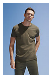
SOL'S REGENT 11380